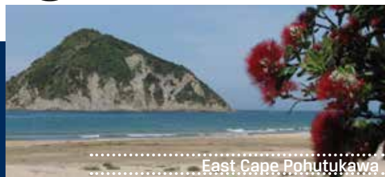
East Cape Pohutukawa