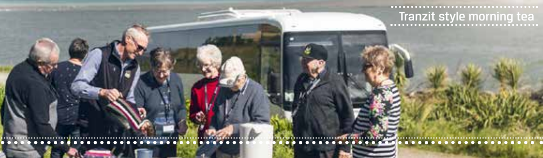
Tranzit style morning tea