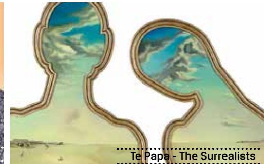
Te Papa - The Surrealists

Includes: morning tea, lunch and guided tours of exhibitions.