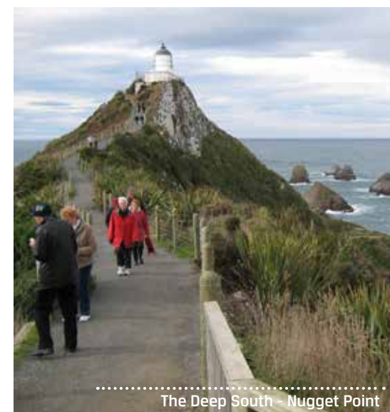
The Deep South - Nugget Point