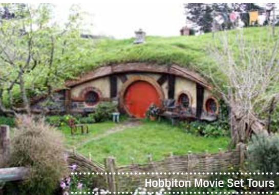
Hobbiton Movie Set Tours