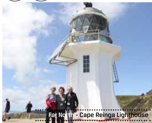
Far North - Cape Reinga Lighthouse