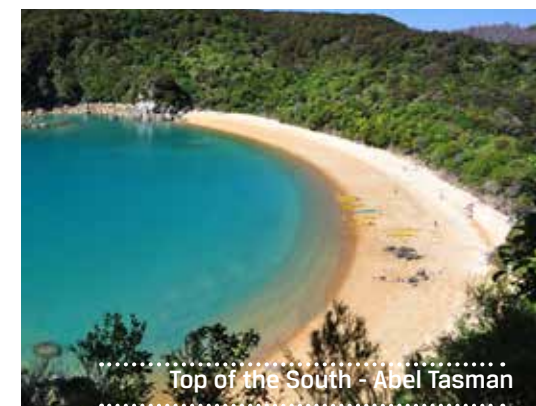
Top of the South - Abel Tasman