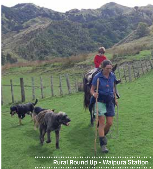
Rural Round Up - Waipura Station