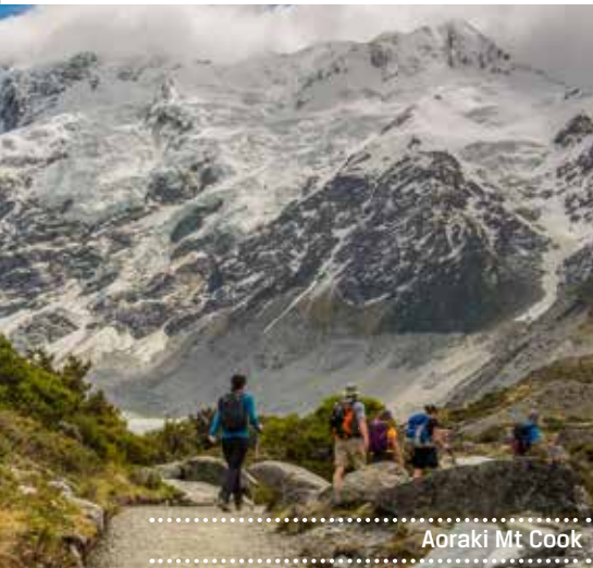
Aoraki Mt Cook

Read a sample of the itinerary: The highest mountain in NZ, Mt Cook was first named Aoraki or 'cloud piercer' by South Island Maori. Feeling inspired, we will take an impressive hike up to a lake at the base of the Hooker Glacier, complete with icebergs! The track is surrounded by peaks, glaciers, native vegetation and mountain streams, and provides excellent views of Mt Cook on a fine day.