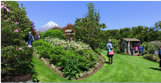
Taranaki Garden Festival

The rich volcanic soils of Taranaki boast some of the best gardens in the country. Join us as we visit at the height of spring, amid the flush of new seasons' growth and the colourful flurry of rhododendron flowering. From large country gardens to compact town allotments, from formal to enchantingly casual, this tour will delight.