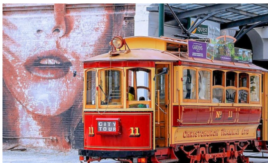
Christchurch - Heritage Tram

Treat yourself to a spring escape to Christchurch, we've uncovered some amazing gems to visit. Visit Ohinetahi Garden, the garden of the late Sir Miles Warren. Learn about the Frozen Continent and pat the huskies at the Antarctic Centre. Take a tour of Ravenscar Art Gallery – an amazing collection donated to the city by its philanthropic owners and sit back and enjoy an elegant evening dining experience on the Christchurch Tram.