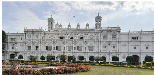
India - Jai Vilas Palace

Our full itinerary is currently being finalised, but you can be assured it will include all the must-see highlights India has to offer.