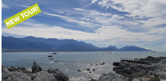
Alpine Pacific Triangle - Kaikoura

Another new tour drops into our calendar, based around a well-known scenic South Island touring route, which takes in the Lewis, Hanmer and Kaikoura areas. A Whale Watch Kaikoura tour promises to be a special highlight.