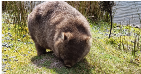
Tasmania - Wombat

mountains to deep river gorges, we leave no stone unturned. The ultimate Tasmanian experience.