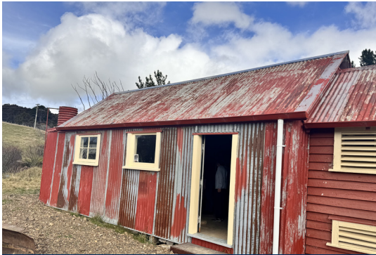
Gentle Annie - Timahanga Station

Explore the Central North Island's lesser travelled interior and the dramatic landscapes of the Rangitikei region. We travel up the historic Moawhango Valley and follow the Inland Patea Heritage Trail (better known as the "Gentle Annie"), from Taihape to Napier. A visit to one of the historic sheep stations on the route is a special highlight!