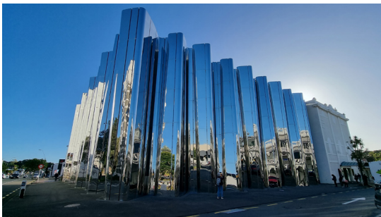
New Plymouth - Len Lye Museum

New Plymouth is our midwinter destination for 2026, offering numerous activities to help us celebrate midwinter with flair and fun.