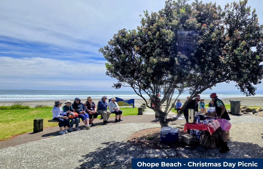
Ohope Beach - Christmas Day Picnic