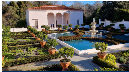
Cambridge - Hamilton Gardens

Enjoy an autumn break in the charming town of Cambridge. The famed trees of Cambridge will be alight with autumn colour and with plenty of great attractions to capture your attention, we are spoilt for choice. Visit Maungatautari Forest Sanctuary - an incredible conservation project. Visit the exceptional Hamilton Gardens, and heritage listed Woodlands Garden and Homestead. But there's more...we have packed plenty into this short getaway!