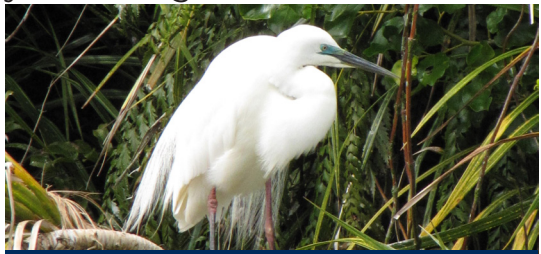
Greenstone Trail - Kotuku

This is one of New Zealand's most unspoilt regions and our tour is full of attractions that cover many of the 'must see and do's' of Westland, which we cover from top to bottom. Have you ever walked among the treetops in a South Westland Rainforest or been wowed by the reflections at Lake Matheson? Walked on the Heaphy track, visited the glaciers or explored the secret waterways of Okarito in search of the sacred white heron? No? Then what are you waiting for?