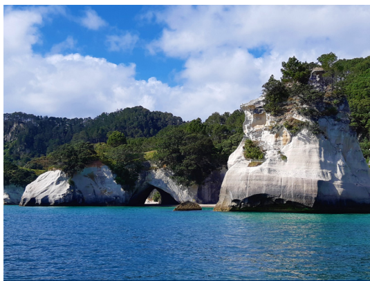
Coromandel - Cathedral Cove

Discover the endless coastlines and sandy coves, the rugged volcanic landscapes and native forests of this scenic region, along with many unique and quirky attractions. With a mountainous interior cloaked in native rainforest and more than 400 kilometres of dazzling white sand beaches, the Coromandel is rustic, unspoiled and relaxed. You will love this tour.