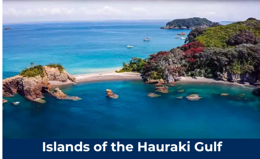
Islands of the Hauraki Gulf