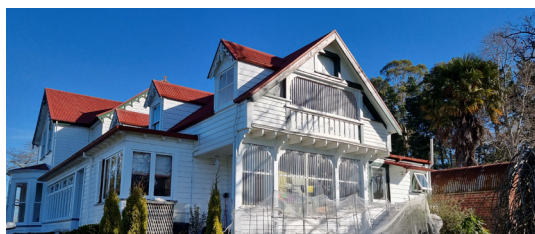
Hawkes Bay - Ashcott Homestead

Hawkes Bay has many historic homesteads that stand as grand reminders of an era of prosperity, when wool was king. Our travels will uncover some of these gems dotted throughout the countryside of the bay.