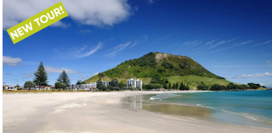
Bay of Plenty - Mt Maunganui