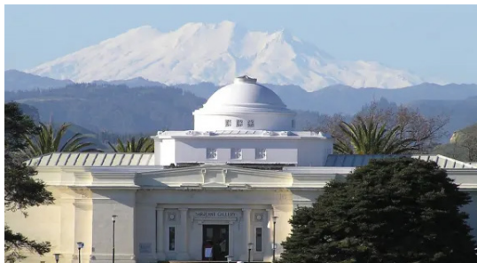
North Island Arts Tour Sarjeant Gallery

From Wellington to Taranaki, we discover and uncover the best from the region's art world. Take a fascinating behind the scenes tour at Te Papa, visit the private galleries of some of our eminent painters, along with regional galleries featuring wonderful treasures.