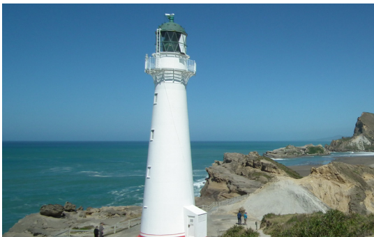
Wairarapa - Castlepoint Lighthouse

Join us as we get off the beaten track to showcase Wairarapa's wild coast, iconic stations, historic homesteads, wines and foods. There is much to see in this scenic region if you take the time, heading over that hill or taking that country road. This short tour is packed with something to appeal to everyone.