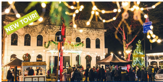
Greytown Festival of Christmas

Greytown throws on its woolly jumpers and puffa jackets and launches into a month-long celebration of Christmas, with amazing lighting, festive food, night markets and gorgeous displays.