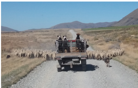
High Country Stations - Rush hour!

Have you recently moved, got a cell phone, got rid of your landline or changed your email address? Do let us know, as we don't want you to miss out on receiving all the latest news about our exciting tours. If you don't want to receive our newsletters any longer we won't be hurt, we would rather know than keep annoying you with unwanted mail.