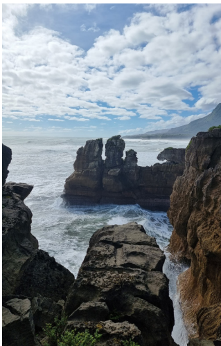
Punakiki Rocks West Coast April 2025