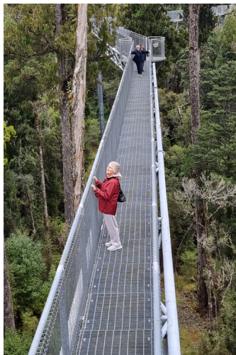
West Coast tree top walk April 2025

Fabouloous snaps from our more recent tours - Thanks to Ali and Andre for the great photography.