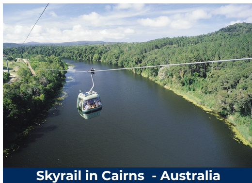
Skyrail in Cairns - Australia

We are now looking towards 2026 for this popular winter destination.