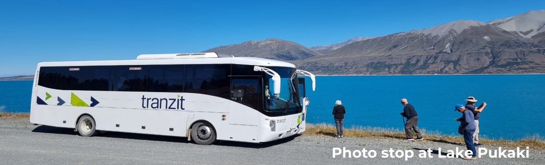
Photo stop at Lake Pukaki