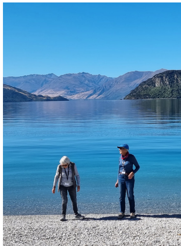
Secluded spot on the shore - Lake Wanaka March 2025