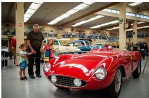
Southward Car Museum