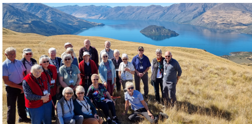
Happy travellers - West Wanaka March 2025