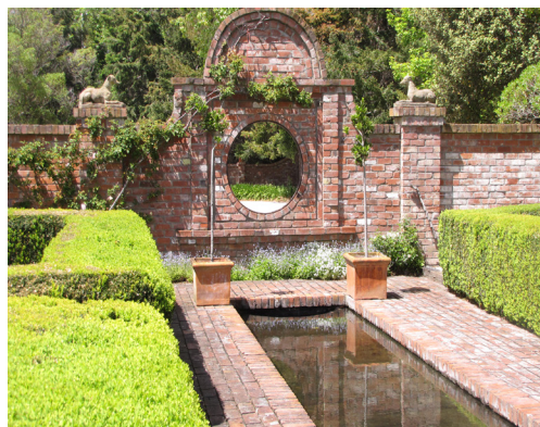
Hurunui Gardens - Winterhome Garden

Hurunui Garden Festival is gaining a reputation as a first-class garden event. Gorgeous gardens from all over this region (near Hanmer Springs) open their gates so festival goers can visit gardens of national significance, horticultural delights and elegant rural properties with mountain vistas. View art and sculpture and find inspiration in the gardens of others. We will also be visiting some of our favourite Marlborough Gardens, so don't miss this opportunity to see some of the best gardens in the country.