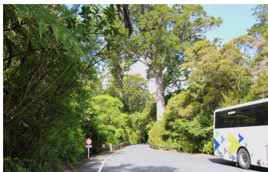
Waipoua Forest - Far North

The Far North tour returns as we plot the history of the unique Northland kauri industry and see ancient kauri. We drive along the endless sands of 90 Mile Beach, cruise to the Hole in the Rock, visit the amazing sculpture park at Matakana, discover the Kumara Capital of Dargaville, and uncover an amazing whaling museum in a remote tranquil spot.