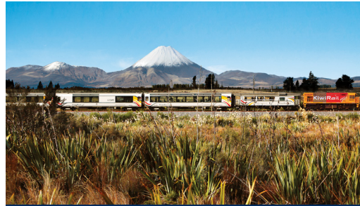
Northern Explorer at National Park

Northern Explorer train to Taumarunui, featuring numerous soaring viaducts and the engineering marvel of the Raurimu Spiral. This short break stays in Ohakune and is packed full of other attractions including a Dinosaur Museum housed in a beautiful heritage building, unique and charming gardens in the Taumarunui area and one of NZ's largest rural Alpaca farms.