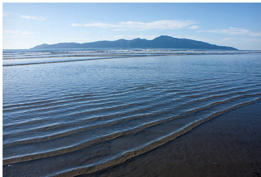
Midwinter Lunch - Kapiti Coast