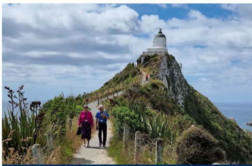
Deep South - Nugget Point, Catlins

Returning in 2025 by popular demand. Join us on our southern-most sojourn as we travel the full Southern Scenic Route from Dunedin via the ruggedly dramatic Catlins Coast to Invercargill, and on to stunning Fiordland. We really get to tick off those bucket list destinations, with a cruise in tranquil Doubtful Sound and an overnight stay on Stewart Island being special highlights.