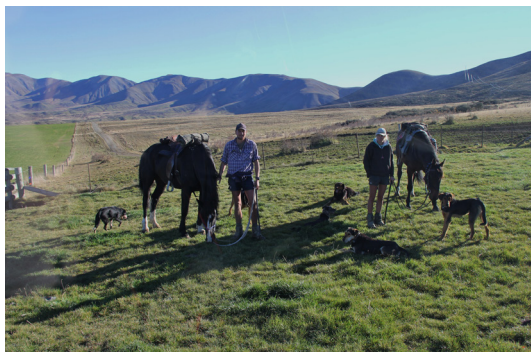
Musterers & Dogs Molesworth Station

This is one of our most popular tours and we've made it even better, introducing you to more remote areas. We use specially designed vehicles that take you comfortably through the soaring back country terrain of Molesworth Station (NZ's largest). BUT THAT'S NOT ALL... we also tour through the stunning and constantly changing landscapes of Rainbow Station and visit a hill country property in the Leader Valley with unique geological features. We use a local guide whose knowledge is extensive, so you will learn the area's history through an informative and entertaining commentary.