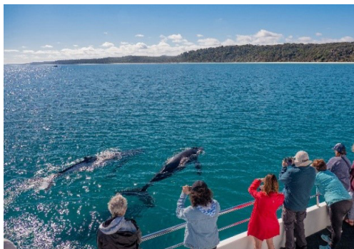
Whale Watching - Fraser Island

World Heritage listed Fraser Island, known as K'gari (meaning paradise) is known for its natural wonders, unspoilt beaches, fantastic weather year-round and incredible scenery. This tour also takes in the sights of Brisbane and Hervey Bay - a recognised whale migratory path, and where we join a special whale watch cruise.