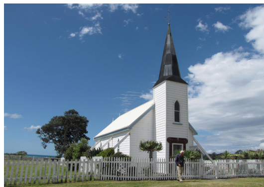
Raukokore Church - East Cape

We ride the rails at Awakeri, stay at stunningly isolated Hicks Bay, stroll on the Tolaga Bay Wharf, and lunch at the local in Waihou and Tokomaru Bays. A stroll through Eastwoodhill Arboretum is another special attraction on this tour that is sure to please.