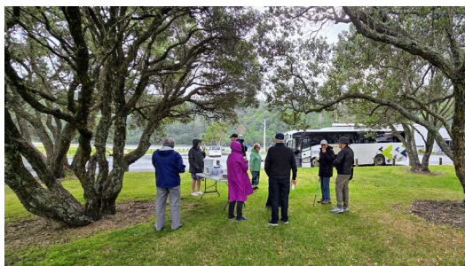
Tea break! - Whangamata April 2025