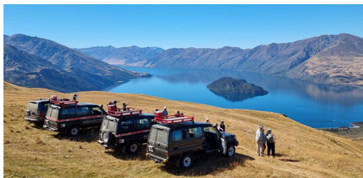
4X4 touring - West Wanaka March 2025