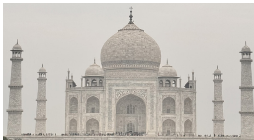
The Taj Mahal - Agra, India