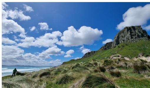
Chatham Island - Maunganui

We return to this remote part of NZ to discover the unique landscapes and natural history, learn about the lifestyle of the Chatham Islanders and enjoy fabulous meals featuring abundant seafood. Every day is an adventure as our travels uncover unusual geological formations, remote fishing villages and a rich flora and fauna - all interwoven with the unique Chathams history of the Moriori.