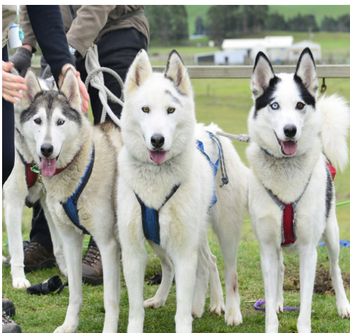
Huskies - Christmas in Rotorua

This will be a Christmas to remember. Join us for a fun and festive time with friends old and new!