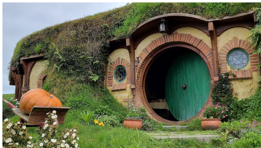
Hobbiton - Mountains to Sea

of Hobbiton and enjoy the delicious “fayre” at the Green Dragon Inn.