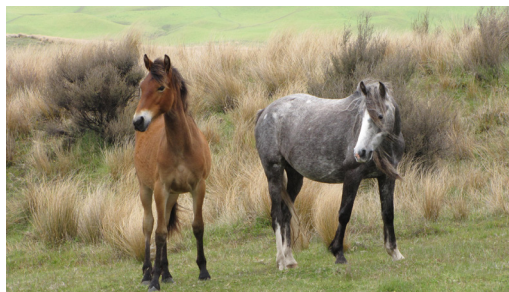
Wild Horses - The Kaimanawas

A rare opportunity to encounter the famous heritage horses of the Kaimanawa Ranges in their natural habitat. Travelling over NZ Defence land normally closed to the public, we are very privileged to be able to enjoy this experience. We are joined by a Kaimanawa Heritage guide who knows where to find the mares, foals, and stallions roaming free in their family bands amongst spectacular back country scenery.