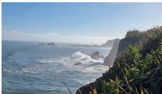
Cape Foulwind - West Coast April 2025