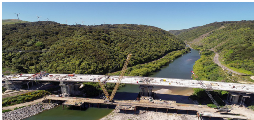
Parahaki Bridge on the new road