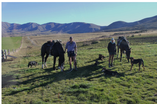
Musterers & Dogs Molesworth Station

This is one of our most popular tours and we've made it even better, introducing you to more remote areas. We use specially designed vehicles that take you comfortably through the soaring back country terrain of Molesworth Station (NZ's largest). BUT THAT'S NOT ALL... we also tour through the stunning and constantly changing landscapes of Rainbow Station and visit a hill country property in the Leader Valley with unique geological features. We use a local guide whose knowledge is extensive, so you will learn the area's history through an informative and entertaining commentary.