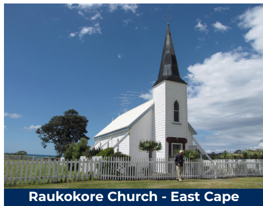
Raukokore Church - East Cape

We ride the rails at Awakeri, stay at stunningly isolated Hicks Bay, stroll on the Tolaga Bay Wharf, and lunch at the local in Waihou and Tokomaru Bays. A stroll through Eastwoodhill Arboretum is another special attraction on this tour that is sure to please.