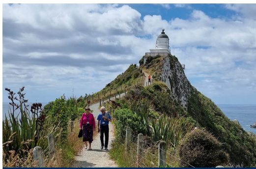
Deep South - Nugget Point, Catlins

Returning in 2025 by popular demand. Join us on our southern-most sojourn as we travel the full Southern Scenic Route from Dunedin via the ruggedly dramatic Catlins Coast to Invercargill, and on to stunning Fiordland. We really get to tick off those bucket list destinations, with a cruise in tranquil Doubtful Sound and an overnight stay on Stewart Island being special highlights.