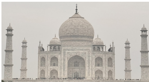
The Taj Mahal - Agra, India