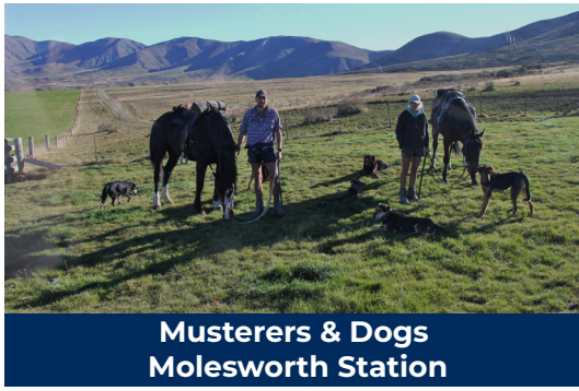
Musterers & Dogs Molesworth Station