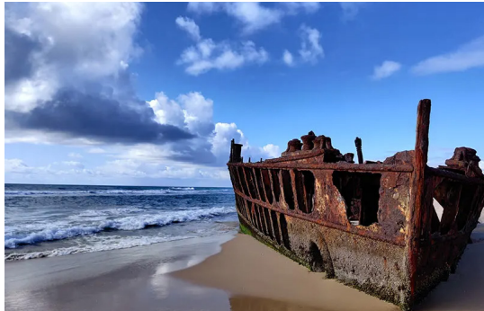
Shipwreck - Fraser Island

World Heritage listed Fraser Island, known as K'gari (meaning paradise) is known for its natural wonders, unspoilt beaches, fantastic weather year-round and incredible scenery. This tour also takes in the sights of Brisbane and Hervey Bay - a recognised whale migratory path, and where we join a special whale watch cruise.