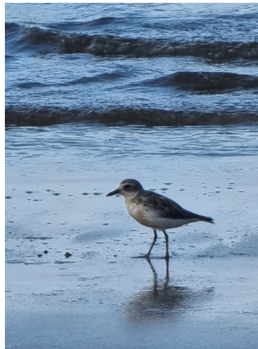
Dotterel spotting Great Barrier Island February 2025