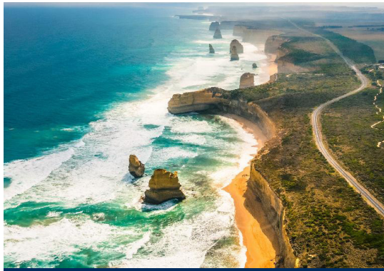
The Great Ocean Rd - Victoria