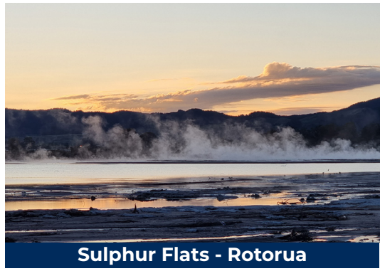
Sulphur Flats - Rotorua

Join us for a fun and festive time with friends old and new!