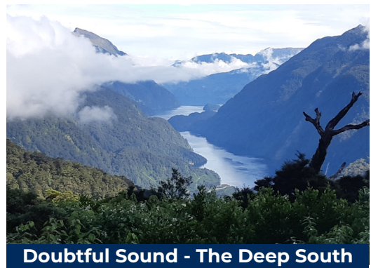
Doubtful Sound - The Deep South

We return to this remote part of NZ to discover the unique landscapes and natural history, learn about the lifestyle of the Chatham Islanders and enjoy fabulous meals featuring