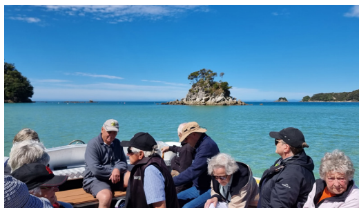
Torrent Bay boat ride Top of the South Tour 2024