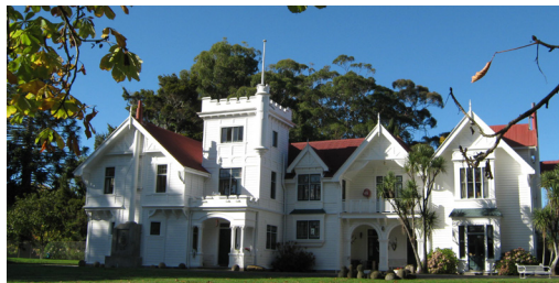
Historical Brancepeth Station Wairarapa

We are excited to announce a jam-packed tour this October, combining the best of art, wine, and historical delights! Travel from the Bay of Plenty to the stunning Wairarapa Valley, where you'll explore world-class wineries and enjoy a stay in the charming village of Martinborough. We will visit renowned Wairarapa homesteads, including the historic Brancepeth Station. Indulge in boutique shopping in the charming heritage village of Greytown, known for its beautifully preserved Victorian architecture. Then, it's off to Wellington for the spectacular World of Wearable Art Show - a dazzling fusion of fashion, theatre, and creativity. This unforgettable experience is perfect for lovers of the arts, wine and history whilst amongst great company.