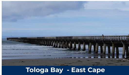
Tolaga Bay - East Cape

Returning in 2025 by popular demand. Join us on our southern-most sojourn as we travel the full Southern Scenic Route from Dunedin via the ruggedly dramatic Catlins Coast to Invercargill, and on to stunning Fiordland. We really get to tick off those bucket list destinations, with a cruise in tranquil Doubtful Sound and an overnight stay on Stewart Island being special highlights.