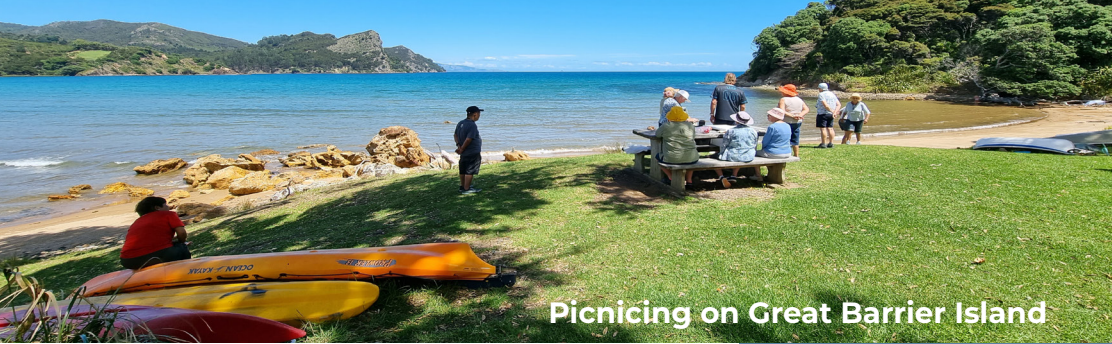
Picnicing on Great Barrier Island