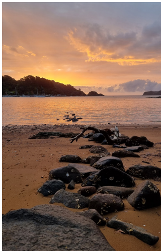
A stunning sunset Great Barrier Island February 2025