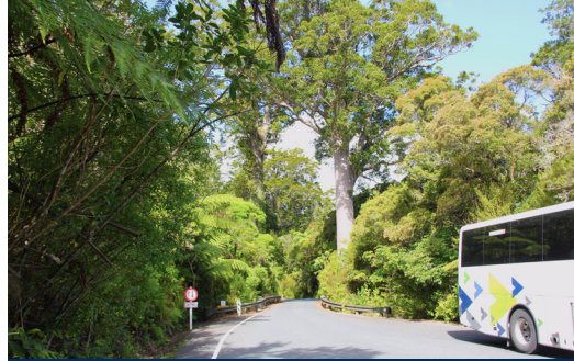
Waipoua Forest - Far North

Drive along the endless sands of 90 Mile Beach, cruise to the Hole in the Rock, visit the amazing sculpture park at Matakana, discover the Kumara Capital of Dargaville, and uncover an amazing whaling museum in a remote tranquil spot.