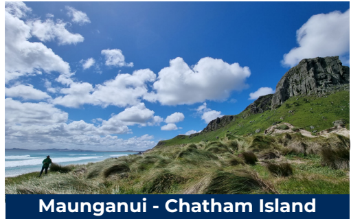
Maunganui - Chatham Island

abundant seafood. Every day is an adventure as our travels uncover unusual geological formations, remote fishing villages and a rich flora and fauna - all interwoven with the unique Chatham's history of the Moriori.