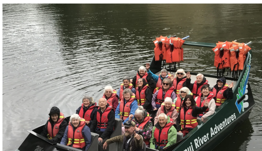
Up the Whanganui River March 2025