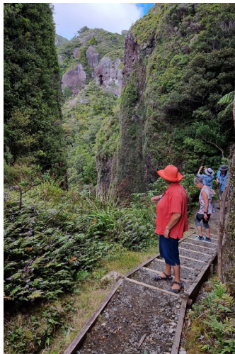
Windy Canyon walk Great Barrier Island February 2025

Fabouloous snaps from our more recent tours - Thanks to Ali and Fleur for the great photography.