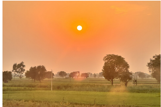
Hazy days in the sun - India