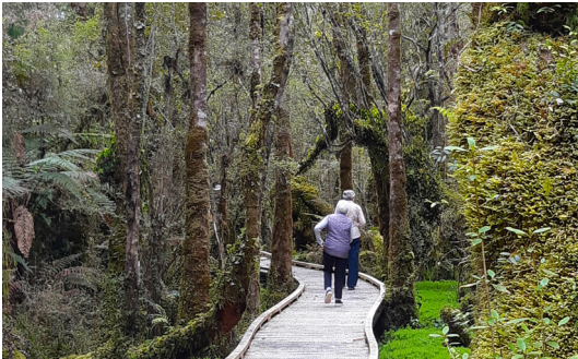
Rainforest Walk - Greenstone Trail

Explore the wild West Coast of the South Island from top to bottom. This is one of New Zealand's most unspoilt regions and our tour is full of attractions that cover many of the 'must see and do's' of Westland. Have you ever walked among the treetops in a South Westland Rainforest or been wowed by the reflections at Lake Matheson? Visited the glaciers or explored the secret waterways of Okarito?