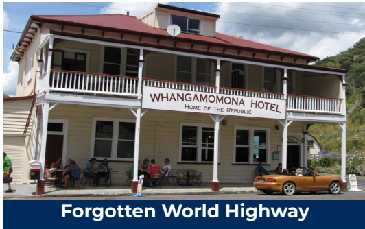
Forgotten World Highway

Experience this remote and mysterious journey, as we wind our way over saddles, through gorges, tunnels and dense forest. The “republic” of Whangamomona, the hand-hewn Moki tunnel, and the remarkable Tangarakau Gorge are highlights on this scenic route that follows an old heritage trail.