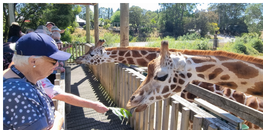
Orana Park - Christmas in Canterbury Tour 2024