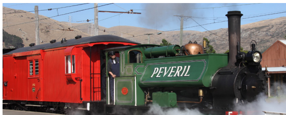
Ferrymead Heritage Park Ride the Rails

Coastal Pacific (Blenheim to Christchurch) excursions are special highlights, but we also discover vintage and branch lines, talk to genuine railway enthusiasts, and learn about the unique history of NZ rail.