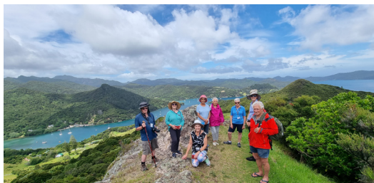
Sunset Rock - Great Barrier Island February 2025