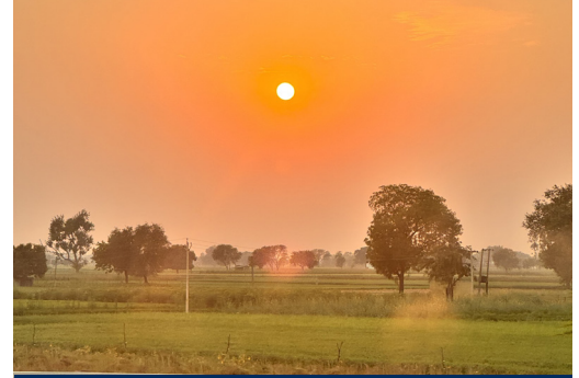
Hazey days in the sun - India