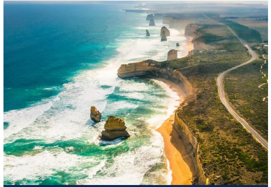
The Great Ocean Rd - Victoria

K'gari (Fraser Island) October 2025 - take a look at this new destination!