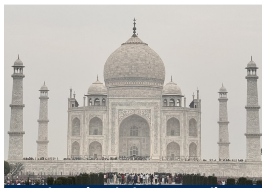
The Taj Mahal - Agra, India