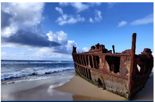
Shipwreck - Fraser Island