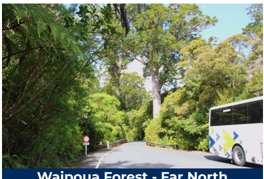
Waipoua Forest - Far North

Drive along the endless sands of 90 Mile Beach, cruise to the Hole in the Rock, visit the amazing sculpture park at Matakana, discover the Kumara Capital of Dargaville, and uncover an amazing whaling museum in a remote tranquil spot.