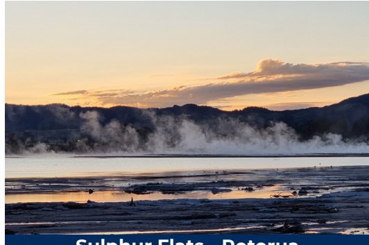
Sulphur Flats - Rotorua

Join us for a fun and festive time with friends old and new!