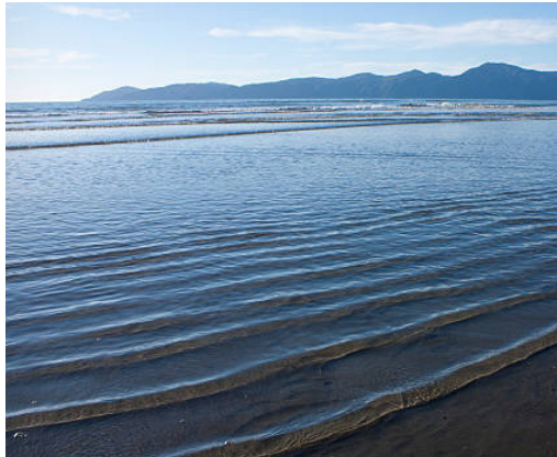
Kapiti Coast Waterfront