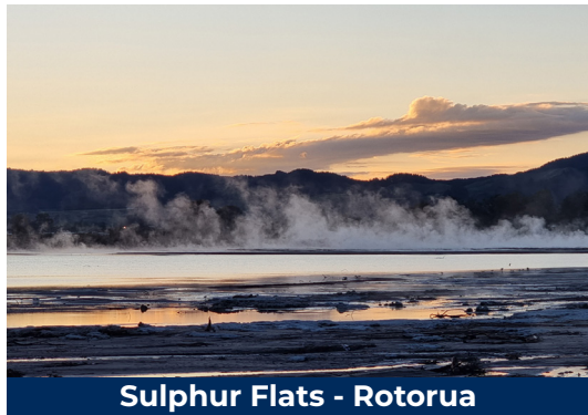
Sulphur Flats - Rotorua

Join us for a fun and festive time with friends old and new!