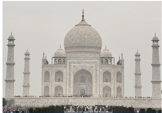
The Taj Mahal - Agra, India

World Heritage listed Fraser Island, known as K'gari (meaning paradise) is known for its natural wonders, unspoilt beaches, fantastic weather year-round and incredible scenery. This tour also takes in the sights of Brisbane and Hervey Bay - a recognised whale migratory path, and where we join a special whale watch cruise.