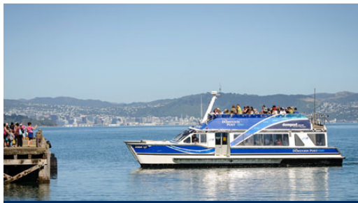
East West Ferry