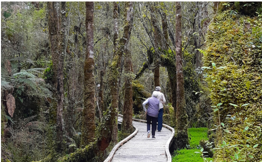
Rainforest Walk - Greenstone Trail

Explore the wild West Coast of the South Island from top to bottom. This is one of New Zealand's most unspoilt regions and our tour is full of attractions that cover many of the 'must see and do's' of Westland. Have you ever walked among the treetops in a South Westland Rainforest or been wowed by the reflections at Lake Matheson? Visited the glaciers or explored the secret waterways of Okarito?