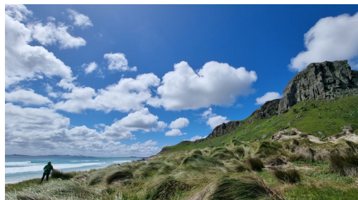
Maunganui - Chatham Island

abundant seafood. Every day is an adventure as our travels uncover unusual geological formations, remote fishing villages and a rich flora and fauna - all interwoven with the unique Chathams history of the Moriori.