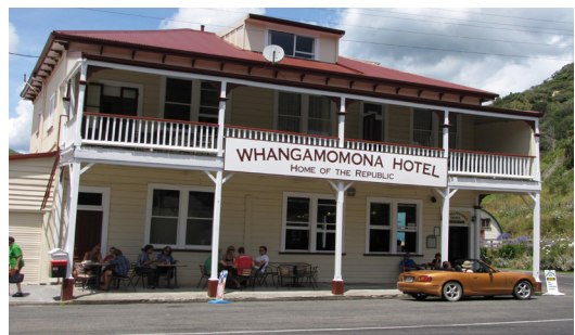
Forgotten World - Whangamomona Hotel

Experience this remote and mysterious journey, as we wind our way over saddles, through gorges, tunnels and dense forest. The "republic" of Whangamomona, the hand-hewn Moki tunnel, and the remarkable Tangarakau Gorge are highlights on this scenic route that follows an old heritage trail.