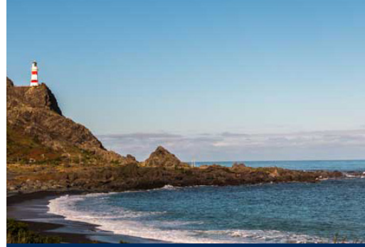
Cape Palliser - Wairarapa

Depart: 8.15am Waldegrave St Return: 6.00pm Waldegrave St Price: $174.00– due by 26 Nov Includes: coach and lunch, your first drink & a prezzie Banking reference: Palliser24