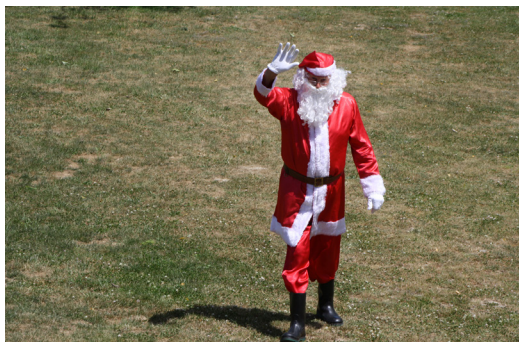
Christmas cheer! - Tuhiterata