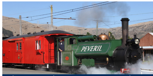
Ride the Rails - Ferrymead Heritage Park

This is one of our most popular tours, so don't miss out; register your interest now and rediscover the joy of train travel.