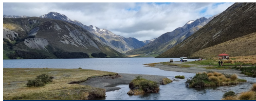
Molesworth Station - Lake Tennyson

This is one of our most popular tours and we've made it even better, introducing you to more remote areas. We use specially designed vehicles that take you comfortably through the soaring back country terrain of Molesworth Station (NZ's largest). BUT THAT'S NOT ALL... we also tour through the stunning and constantly changing landscapes of Rainbow Station and visit a hill country property in the Leader Valley with unique geological features. We use a local guide whose knowledge is extensive, so you will learn the area's history through an informative and entertaining commentary.