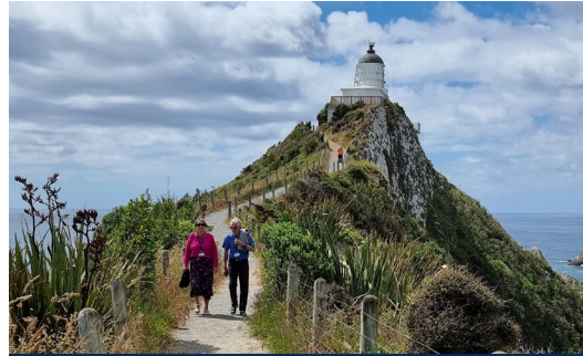
Deep South - Nugget Point

Returning in 2025 by popular demand. Join us on our southern-most sojourn as we travel the full Southern Scenic Route from Dunedin via the ruggedly dramatic Catlins Coast to Invercargill, and on to stunning Fiordland. A cruise in tranquil Doubtful Sound and an overnight stay on Stewart Island are special highlights.