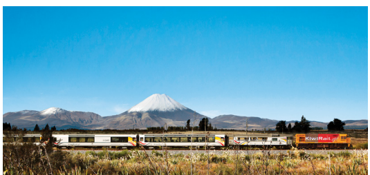
Ohakune - Northern Explorer

Featuring a train journey on the Northern Explorer through the dramatic landscapes and towering viaducts of the Rangitikei and Tongariro Districts, as well as the engineering marvel of the Raurimu Spiral. We stay in the alpine village of Ohakune and uncover other attractions of this scenic region including a unique and charming garden in the Taumarunui area, one of NZ's largest Alpaca