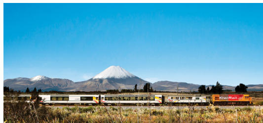
Ohakune - Northern Explorer

Featuring a train journey on the Northern Explorer through the dramatic landscapes and towering viaducts of the Rangitikei and Tongariro Districts, as well as the engineering marvel of the Raurimu Spiral. We stay in the alpine village of Ohakune and uncover other attractions of this scenic region including a unique and charming garden in the Taumarunui area, one of NZ's largest Alpaca