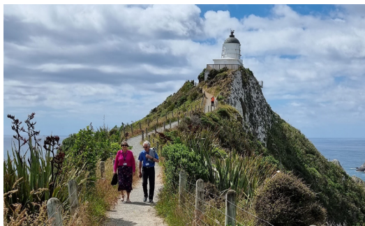
Deep South - Nugget Point

Returning in 2025 by popular demand. Join us on our southern-most sojourn as we travel the full Southern Scenic Route from Dunedin via the ruggedly dramatic Catlins Coast to Invercargill, and on to stunning Fiordland. A cruise in tranquil Doubtful Sound and an overnight stay on Stewart Island are special highlights.