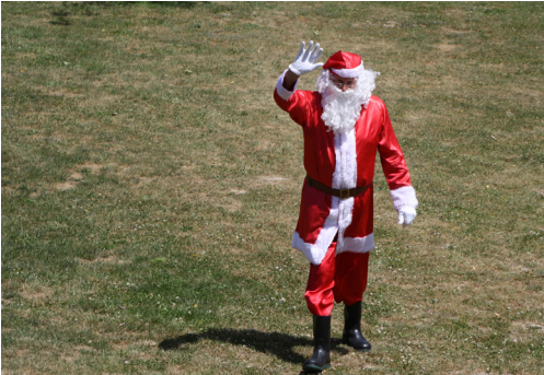
Christmas Cheer - Tuhiterata