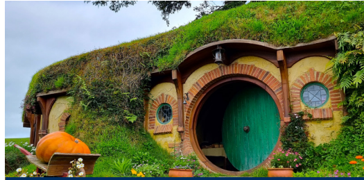
Mountains to Sea - Hobbiton

step into the enchanting world of Hobbiton and enjoy the delicious "fayre" at the Green Dragon Inn.