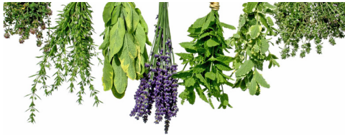
The Herb Farm

Includes: coach, lunch, talk and garden tour