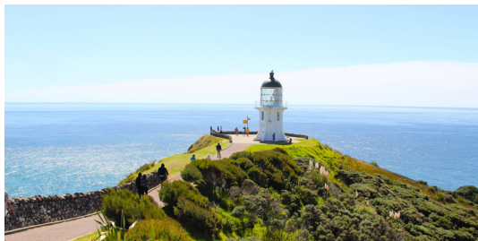
Far North - Cape Reinga Lighthouse

The Far North returns as we plot the history of the unique Northland kauri industry and connect with ancient