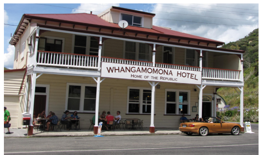
Forgotten World - Whangamomona Hotel

Experience this remote and mysterious journey, as we wind our way over saddles, through gorges, tunnels and dense forest. The "republic" of Whangamomona, the hand-hewn Moki tunnel, and the remarkable Tangarakau Gorge are highlights on this scenic route that follows an old heritage trail.