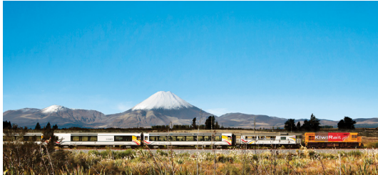
Ohakune - Northern Explorer

Featuring a train journey on the Northern Explorer through the dramatic landscapes and towering viaducts of the Rangitikei and Tongariro Districts, as well as the engineering marvel of the Raurimu Spiral. We stay in the alpine village of Ohakune and uncover other attractions of this scenic region including a unique and charming garden in the Taumarunui area, one of NZ's largest Alpaca