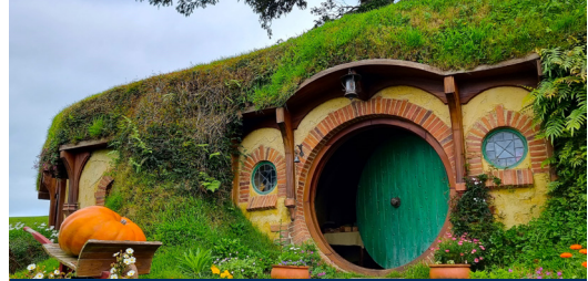
Mountains to Sea - Hobbiton

step into the enchanting world of Hobbiton and enjoy the delicious "fayre" at the Green Dragon Inn.