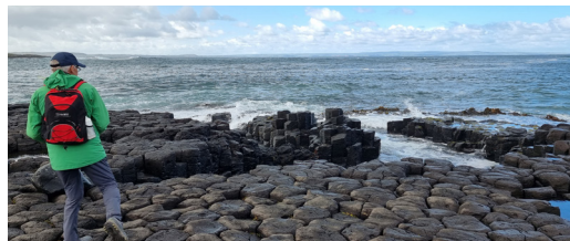
Chatham Island - Basalt Rocks

We return to this remote part of NZ to discover the unique landscapes and natural history, learn about the lifestyle of the Chatham Islanders and enjoy fabulous meals featuring abundant seafood. Every day is an adventure as our travels uncover unusual geological formations, remote fishing villages and a rich flora and fauna - all interwoven with the unique Chathams history of the Moriori.