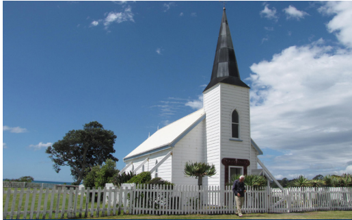
East Cape - Raukokore Church

the local at Waihau and Tokomaru Bays. Take the opportunity to soak in the mineral pools at Morere Hot Springs, and much more.