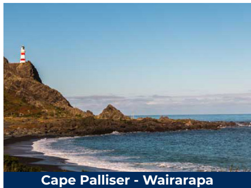
Cape Palliser - Wairarapa