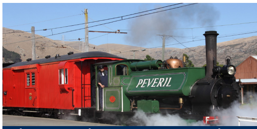
Ride the Rails - Ferrymead Heritage Park

This is one of our most popular tours, so don't miss out; register your interest now and rediscover the joy of train travel.