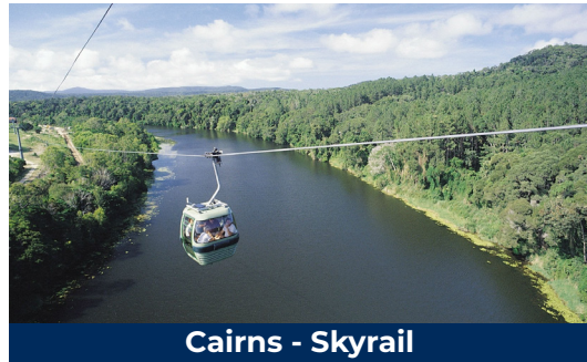
Cairns - Skyrail