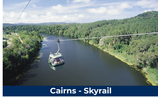
Cairns - Skyrail