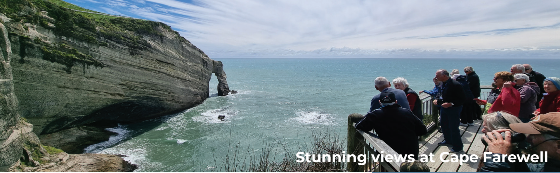
Stunning views at Cape Farewell