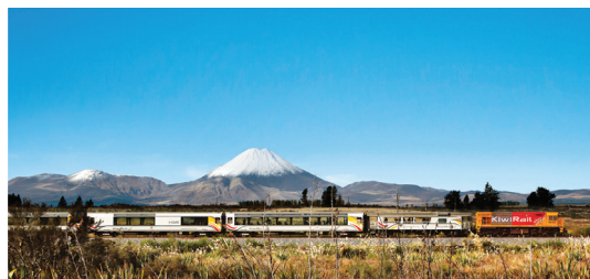
Ohakune - Northern Explorer

Featuring a train journey on the Northern Explorer through the dramatic landscapes and towering viaducts of the Rangitikei and Tongariro Districts, as well as the engineering marvel of the Raurimu Spiral. We stay in the alpine village of Ohakune and uncover other attractions of this scenic region including a unique and charming garden in the Taumarunui area, one of NZ's largest Alpaca