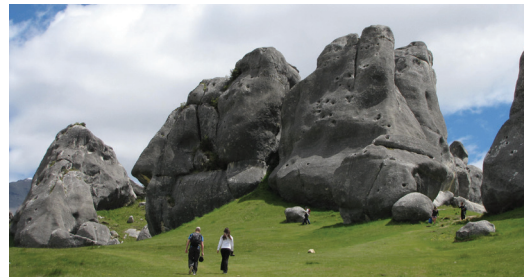
Christmas in Canterbury - Castlehill

Yes, this year we head to the "Garden City" for our festive break. Christchurch has much to offer with its unique blend of heritage and new buildings as the city has risen from the ruins of its devastating earthquakes. But we uncover gems throughout the Canterbury region, from Banks Peninsula and Akaroa exploring, to a Christmas Day adventure in the Canterbury High Country. From the great Canterbury Rivers to the sea with everything in between. This tour is guaranteed to be fun, fabulous and festive!