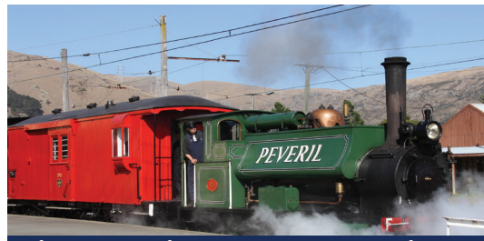
Ride the Rails - Ferrymead Heritage Park

This is one of our most popular tours, so don't miss out; register your interest now and rediscover the joy of train travel.