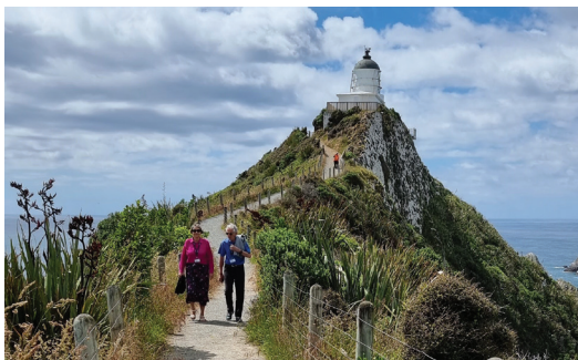
Deep South - Nugget Point

Returning in 2025 by popular demand. Join us on our southern-most sojourn as we travel the full Southern Scenic Route from Dunedin via the ruggedly dramatic Catlins Coast to Invercargill, and on to stunning Fiordland. A cruise in tranquil Doubtful Sound and an overnight stay on Stewart Island are special highlights.