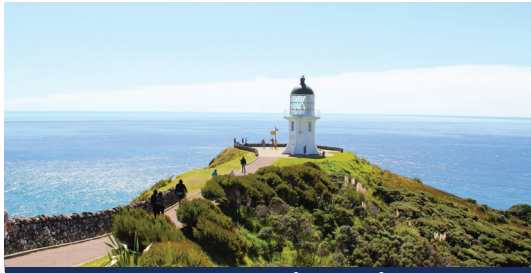
Far North - Cape Reinga Lighthouse

The Far North returns as we plot the history of the unique Northland kauri industry and connect with ancient