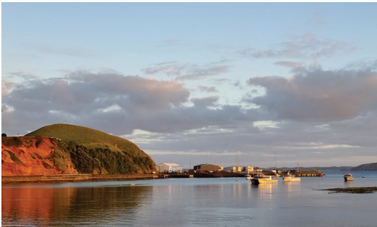
Chatham Island - Waitangi Wharf

We return to this remote part of NZ to discover the unique landscapes and natural history, learn about the lifestyle of the Chatham Islanders and enjoy fabulous meals featuring abundant seafood. Every day is an adventure as our travels uncover unusual geological formations, remote fishing villages and a rich flora and fauna - all interwoven with the unique Chathams history of the Moriori.