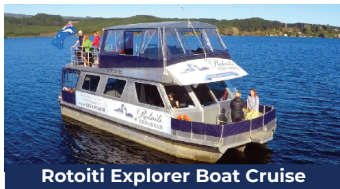
Rotoiti Explorer Boat Cruise