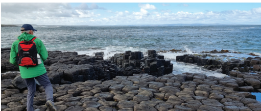
Chatham Island - Basalt Rocks

We return to this remote part of NZ to discover the unique landscapes and natural history, learn about the lifestyle of the Chatham Islanders and enjoy fabulous meals featuring abundant seafood. Every day is an adventure as our travels uncover unusual geological formations, remote fishing villages and a rich flora and fauna - all interwoven with the unique Chathams history of the Moriori.