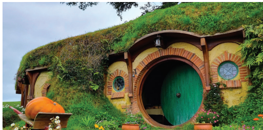
Mountains to Sea - Hobbiton

step into the enchanting world of Hobbiton and enjoy the delicious "fayre" at the Green Dragon Inn.