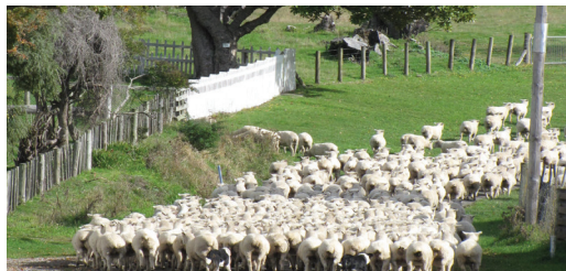
Gentle Annie - Moawhango Valley

Explore the Central North Island's lesser travelled interior and the dramatic landscapes of the Rangitikei region. We travel up the historic Moawhango Valley and follow the Inland Patea Heritage Trail (better known as the "Gentle Annie"), from Taihape to Napier. A visit to a vast sheep station is a special highlight!