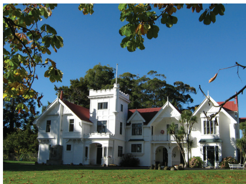
Wairarapa Tour - Brancepeth Homestead