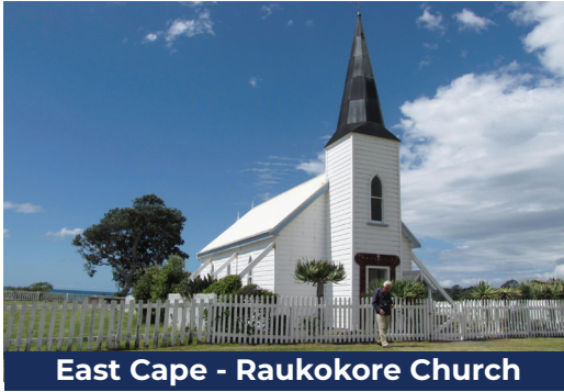
East Cape - Raukokore Church

the local at Waihau and Tokomaru Bays. Take the opportunity to soak in the mineral pools at Morere Hot Springs, and much more.