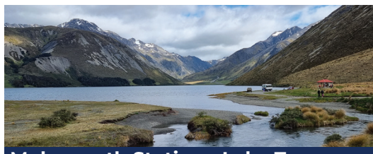
Molesworth Station - Lake Tennyson

This is one of our most popular tours and we've made it even better, introducing you to more remote areas. We use specially designed vehicles that take you comfortably through the soaring back country terrain of Molesworth Station (NZ's largest). BUT THAT'S NOT ALL... we also tour through the stunning and constantly changing landscapes of Rainbow Station and visit a hill country property in the Leader Valley with unique geological features. We use a local guide whose knowledge is extensive, so you will learn the area's history through an informative and entertaining commentary.