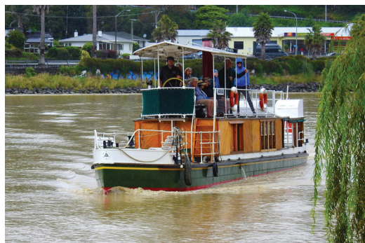
Up the Whanganui River - MV Wairua

Offering many ways to experience the mystical Whanganui River, from a jet boat ride with a walk to the Bridge to Nowhere. Enjoy gentle excursions on two of the river's famous historic steamers, and a road trip down the valley through many historic settlements. One of our favourite tours, so don't miss out!