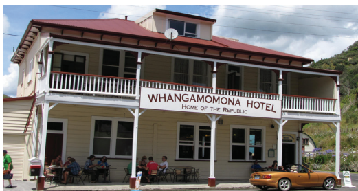
Forgotten World - Whangamomona Hotel

Experience this remote and mysterious journey, as we wind our way over saddles, through gorges, tunnels and dense forest. The "republic" of Whangamomona, the hand-hewn Moki tunnel, and the remarkable Tangarakau Gorge are highlights on this scenic route that follows an old heritage trail.