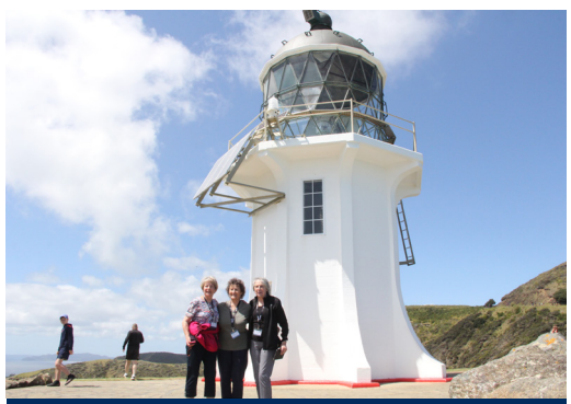
Far North - Cape Reinga Lighthouse

Drive along the endless sands of 90 Mile Beach, cruise to the Hole in the Rock, visit the amazing sculpture park at Matakana, discover the Kumara Capital of Dargaville, and uncover an amazing whaling museum in a remote tranquil spot.