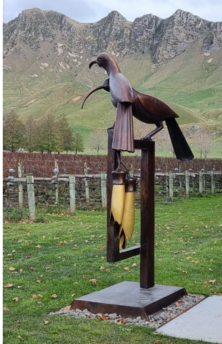
Huia statue, Craggy Range