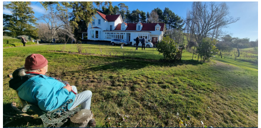
Tea break at Ashcott Homestead