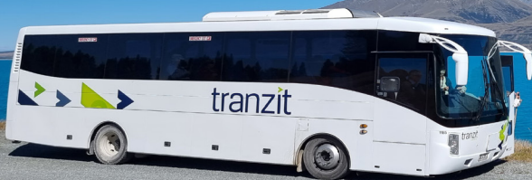
Photo stop at Lake Pukaki