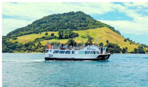
Bay Explorer

Join us for a relaxing and scenic day out exploring the stunning beauty of Tauranga's harbour. We'll enjoy a delicious waterfront lunch at Harbourside, soaking in the views, before heading down to Bay Explorer - Dolphin and Wildlife Cruises. We cruise the beautiful Tauranga Harbour with expert commentary, fresh sea air, and the chance to spot local marine wildlife. A perfect day of great company, good food, and gorgeous coastal views. Price: $150 with more details to follow