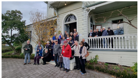
Happy travellers outside Duart House