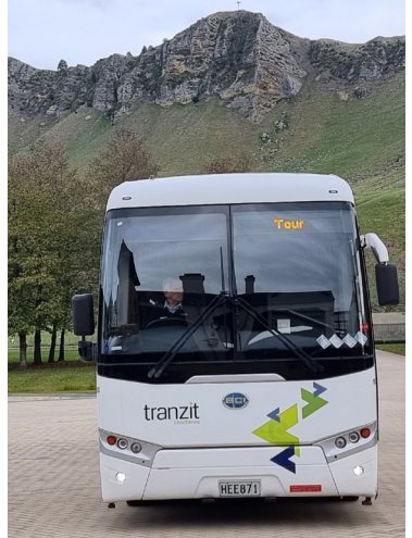
Our smart coach with Te Mata Peak behind