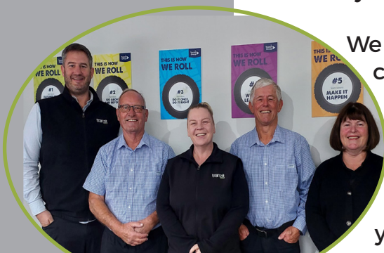
YOUR TOURS TEAM

Recently returned is our annual Midwinter tour, this year we had Hawkes Bay in our sights, where great hospitality and fine wintry weather welcomed us. As always, food and beverages featured highly, along with a dash of history and a splash of nature, including a close encounter with takahe at a sanctuary on Cape Kidnappers.