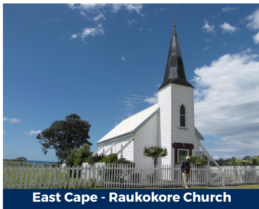
East Cape - Raukokore Church

Explore the scenically and culturally rich East Cape, viewing beautiful churches, discovering isolated bays and taking roads less travelled. We ride the rails at Awakeri, stay at stunningly isolated Hicks Bay, stroll on the Tolaga Bay Wharf, and lunch at the local in Waihou and Tokomaru Bays. A stroll through Eastwoodhill Arboretum is another special attraction on this tour that is sure to please.