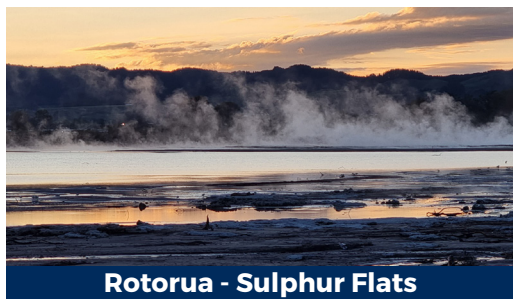
Rotorua - Sulphur Flats

Our festive season commences as we head to Rotorua, a place where the earth breathes and nature paints it's masterpiece. But the Geothermal Capital offers many other special attractions including walking in the canopy of the Redwood Forest, cruising on Lake Rotoiti, viewing a fascinating falcon display at Wingspan Birds of Prey and experiencing a live demonstration of a running 8-dog huskie team. This will be a Christmas to remember. Join us for a fun and festive time with friends old and new!