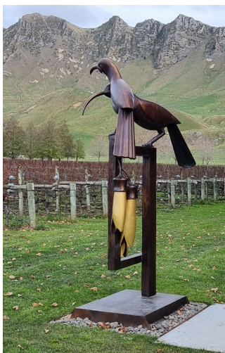
Huia statue, Craggy Range