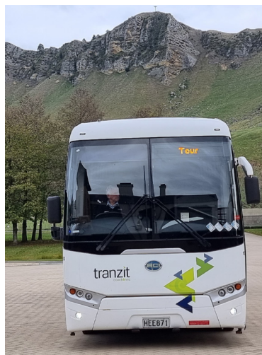
Our smart coach with Te Mata Peak behind