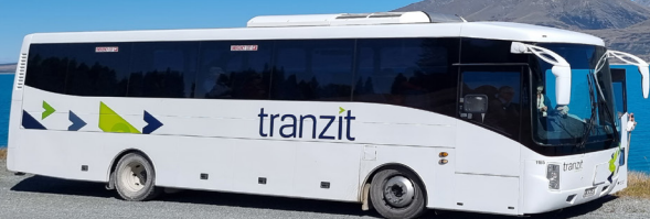
Photo stop at Lake Pukaki