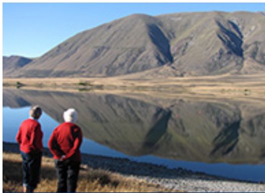
High Country - Lake Camp

Our much-loved high-country tour, exploring the expansive Canterbury High Country returns. Meet the owners who farm this remote and spectacular area, far up in the headwaters of the giant Canterbury Rivers and nestled against the Southern Alps.