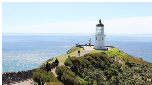
Cape Reinga Lighthouse

The Far North returns as we plot the history of the unique Northland kauri industry and marvel at ancient kauri. We drive along the endless sands of 90 Mile Beach, cruise to the Hole in the Rock, visit an amazing sculpture park at Matakana, discover the kumara capital of Dargaville, and uncover an amazing whaling museum in a remote tranquil spot.