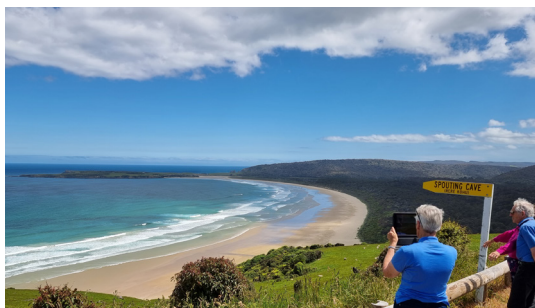
The Deep South - Catlins Coast

Returning in 2025 by popular demand. Join us on our southern-most sojourn as we travel the full Southern Scenic Route from Dunedin via the ruggedly dramatic Catlins Coast to Invercargill, and on to stunning Fiordland. We really get to tick off those bucket list destinations, with a cruise in tranquil Doubtful Sound and an overnight stay on Stewart Island being special highlights.