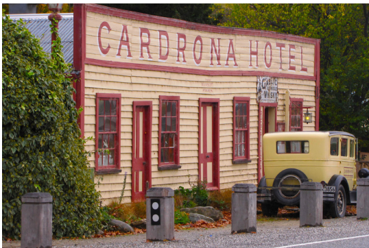
Central Otago - Cardrona

We combine all that's great about this remarkable and unique region. An underlying history of the Otago Goldrush with its tales of endeavour and hardship, has left a legacy of quaint villages and stark sluiced landscapes. But this is a region of outstanding beauty, and visiting in April is a bonus as the colours of autumn erupt.