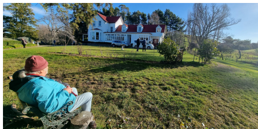
Tea break at Ashcott Homestead