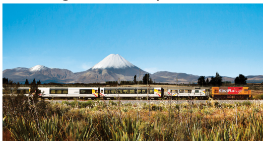
Northern Explorer at National Park

This tour provides the opportunity to travel the 'Northern Scenic' route on the Northern Explorer train to Taumarunui, featuring numerous soaring viaducts and the engineering marvel of the Raurimu Spiral. This short break stays in Ohakune and is packed full of other attractions including a Dinosaur Museum - housed in a beautiful heritage building, unique and charming gardens in the Taumarunui area and one of NZ's largest rural Alpaca farms.