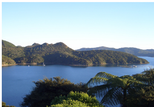
Great Barrier Island - Fitzroy Harbour

Discover this hidden gem of the Hauraki Gulf, encounter unique and endangered wildlife, experience its rugged natural beauty, admire the talents of local artisans, covet the relaxed lifestyle the folk of the Barrier enjoy, and enjoy the endless walking opportunities. A tour for adventurers!