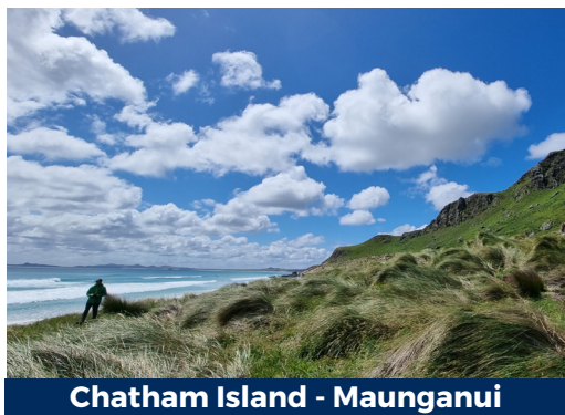
Chatham Island - Maunganui

learn about the lifestyle of the Chatham Islanders and enjoy fabulous meals featuring abundant seafood. Every day is an adventure as our travels uncover unusual geological formations, remote fishing villages and a rich flora and fauna - all interwoven with the unique Chatham's history of the Moriori.