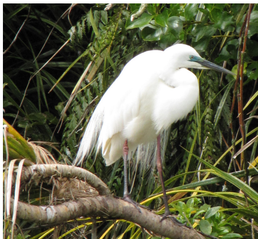
Greenstone Trail - White Heron

This is one of New Zealand's most unspoilt regions and our tour is full of attractions that cover many of the 'must see and do's' of Westland. Have you ever walked among the treetops in a South Westland Rainforest or been wowed by the reflections at Lake Matheson? Visited the glaciers or explored the secret waterways of Okarito in search of the sacred white heron? Then what are you waiting for?