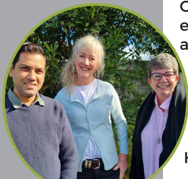
YOUR TOURS TEAM