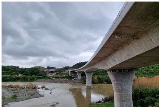
Tararua Highway - Parahaki Bridge