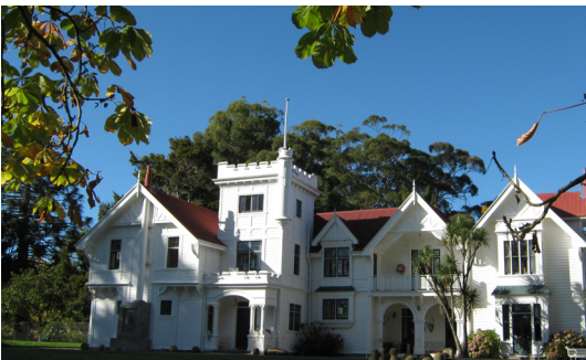
Wairarapa - Brancepeth

Join us as we get off the beaten track to showcase Wairarapa's wild coast, iconic stations and homesteads, wines and foods. There is much to see in this scenic region if you take the time, heading over that hill or taking that country road. This short tour is packed with something to appeal to everyone.