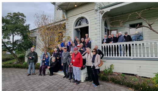
Happy travellers outside Duart House