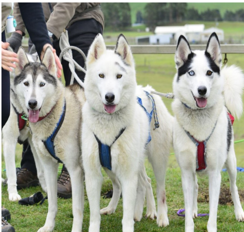
Huskies - Christmas in Rotorua

This will be a Christmas to remember. Join us for a fun and festive time with friends old and new!