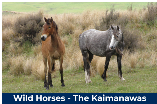
Wild Horses - The Kaimanawas

A rare opportunity to encounter the famous heritage horses of the Kaimanawa Ranges in their natural habitat. Travelling over NZ Defence land normally closed to the public, we are very privileged to be able to enjoy this experience. We are joined by a Kaimanawa Heritage guide who knows where to find the mares, foals, and stallions roaming free in their family bands amongst spectacular back country scenery.