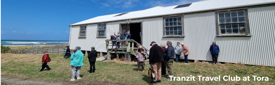
Tranzit Travel Club at Tora