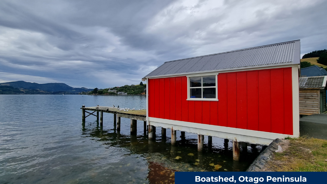
Boatshed, Otago Peninsula