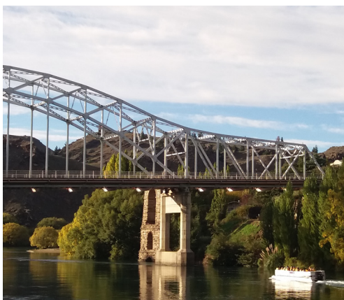
Central Otago - Clutha River