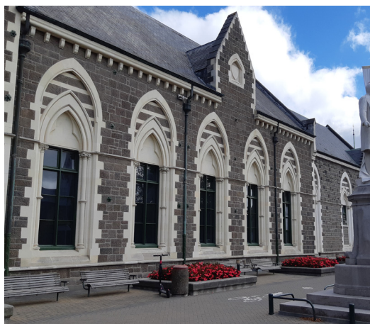
Christchurch - Canterbury Museum

This year we're off to Christchurch to celebrate Christmas in the "Garden City". Guaranteed to be fun, fabulous and festive!!