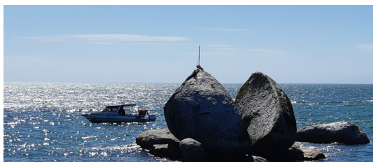
Top of the South - Split Apple Rock

the unmissable Abel Tasman and enjoy a day out on Farewell Spit – a world renowned nature reserve and a special highlight.