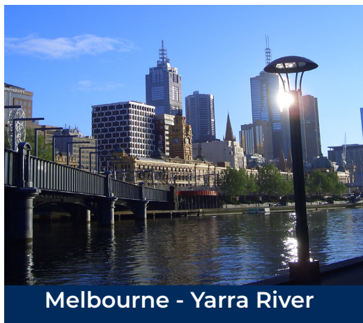
Melbourne - Yarra River

How about this short winter getaway? From our base in the heart of Melbourne, we'll explore this vibrant city, with the languid Yarra River running through its heart. From its parks and gardens to an escape into the Dandenong Ranges and the vineyards of the Yarra Valley. From its grand historic buildings to its multiple world class sporting venues, and a lively arts scene including hit musicals and stage-shows, Melbourne is the city that has it all.