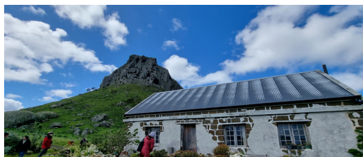
Chatham Island - Stone Cottage

geological formations, remote fishing villages and a rich flora and fauna - all interwoven with the unique Chathams history of the Moriori.