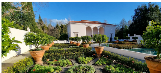
Cambridge - Hamilton Gardens

Enjoy a spring break in the charming town of Cambridge. With plenty of great attractions to capture your attention, we are spoilt for choice. Visit Maungatautari Forest Sanctuary – an incredible conservation project. Take a tour of the Olympic standard Grassroots Cycling Velodrome, and visit heritage listed Woodlands Garden and Homestead. But there's more...we have packed plenty into this short getaway!