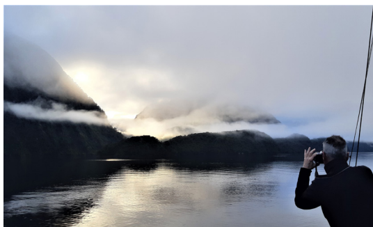
Deep South - Doubtful Sound

Join us on our southern-most sojourn as we travel the full Southern Scenic Route from Dunedin via the ruggedly dramatic Catlins Coast to Invercargill, and on to stunning Fiordland. A cruise in tranquil Doubtful Sound and an overnight stay on Stewart Island are special highlights.