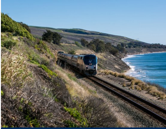
Ride the Rails - Coastal Pacific