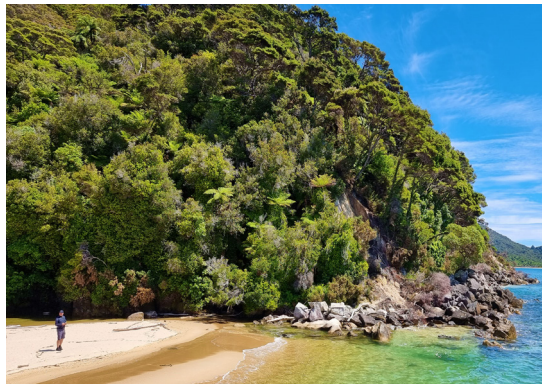
Nelson - Abel Tasman Coast

Join us for a feast of sightseeing around this artistically rich and scenically incomparable region. Visit one of NZ's oldest art galleries, drool over classic cars, have a laugh at Pic's Peanut Butter World, taste fresh fish and chips at the beach and wander gorgeous gardens. You're very welcome!