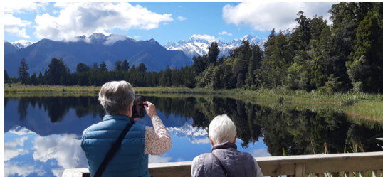
Greenstone Trail - Lake Matheson

Explore the wild West Coast of the South Island - one of New Zealand's most unspoilt regions. The Greenstone Trail is full of attractions that cover many of the 'must see and do's' of this area. Have you ever walked among the treetops in a South Westland Rainforest? Been wowed by the reflections at Lake Matheson? Explored the secret waterways of Okarito searching for the beautiful white heron? Then what are you waiting for?