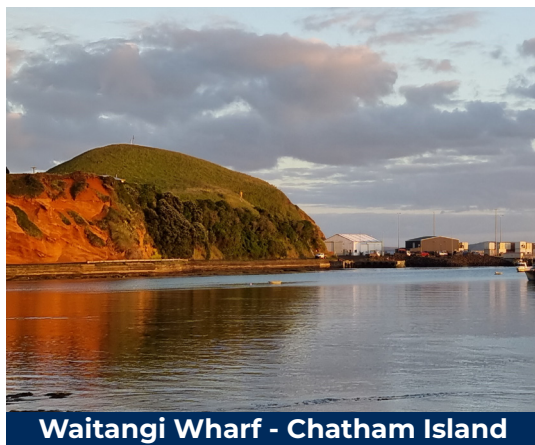
Waitangi Wharf - Chatham Island

To discuss any points above, give us a call on 0800 471 227 .