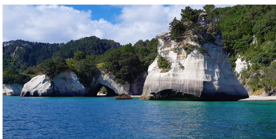
Coromandel - Cathedral Cove

With a mountainous interior cloaked in native rainforest and more than 400 kilometres of dazzling white sand beaches, the Coromandel is rustic, unspoiled and relaxed. You will love this tour.