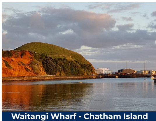
Waitangi Wharf - Chatham Island

To discuss any points above, give us a call on 0800 471 227 .