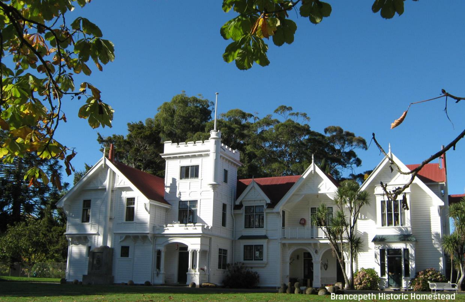
Brancepeth Historic Homestead