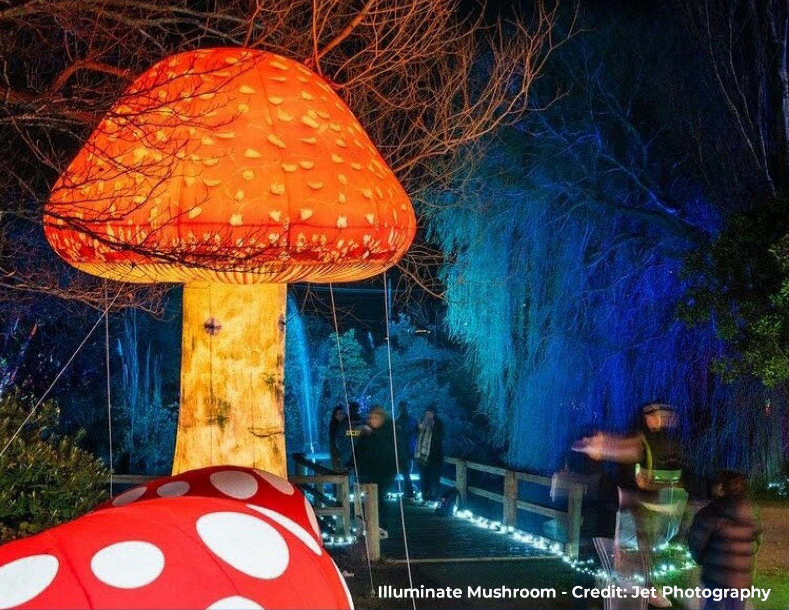
Illuminate Mushroom